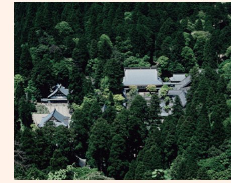
Yokohama-city, Kanagawa Prefecture